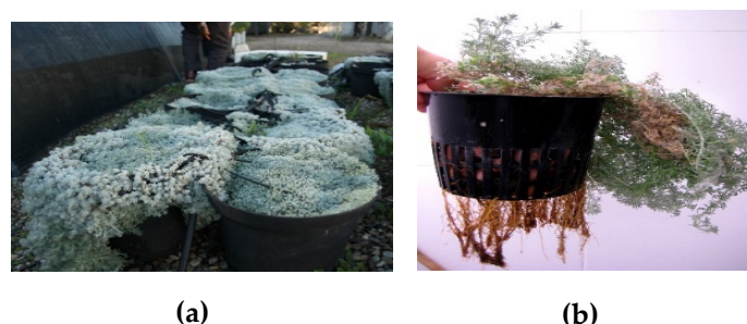
Figure 1. Artemisia pedemontana subsp. assoana pictures from both cultivation methods, namely: (a) plants growing in a greenhouse (AasG); (b) plant growing in an aeroponic system (AasA).

environmental control were morphologically similar to plants from wild populations (shorter and thicker), and flowered after the winter vegetative stage, while the aeroponic plants (AasA), grown with environmental control, remained in the growing stage, did not flower, and grew faster (Figure 1).