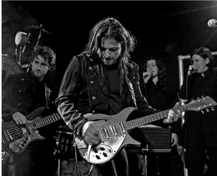
Rosa Crux Picture by Andreia Moutinho (2011)

Within the music of the so-called 'Gothic' movement they do exist many various tendencies. For example there is a clear, huge difference between the 'Post punk' and the 'Ethereal' front.