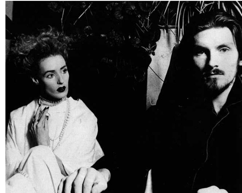
Dead Can Dance Promotional photo (1986)

which was above all the new creative usage of those sonorities, perfectly adequate to the late XX century music.