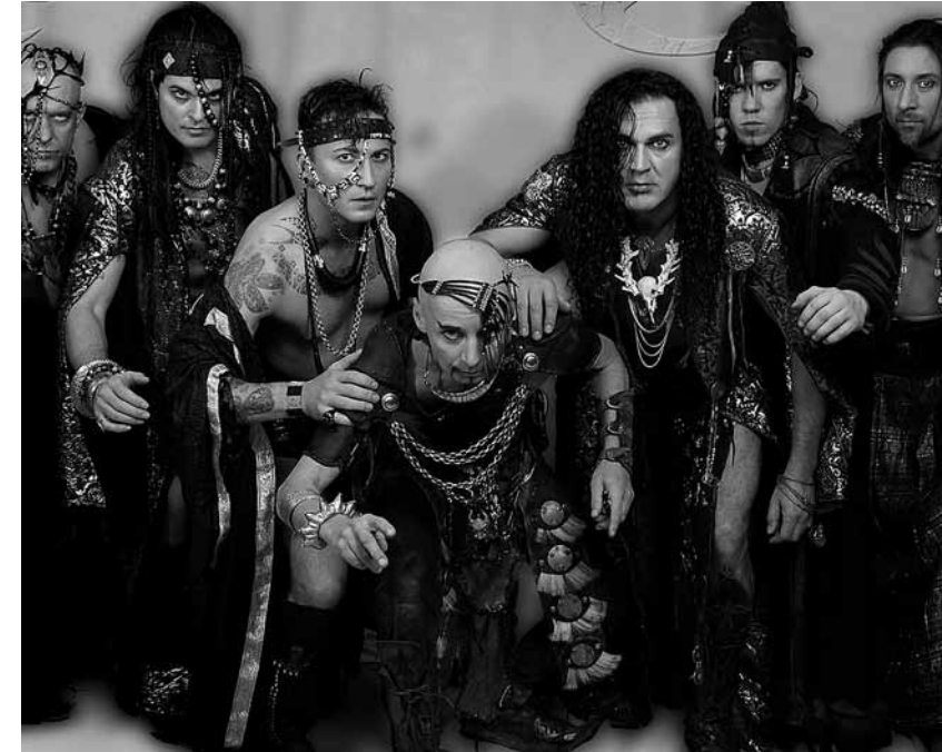
Corvus Corax Promotional picture

Furthermore, it is to be said that the label 'Ethereal' is not such a good one and it is going to be used within this context only because at present we are lacking a better description. We could also talk about 'Neo-classical' bands for example, or 'Neo-Medieval', or 'Neo-Folk' as well but also 'Dark Wave' and so on, picking one of the many conventional labels that journalists have used in the past in the attempt to create a