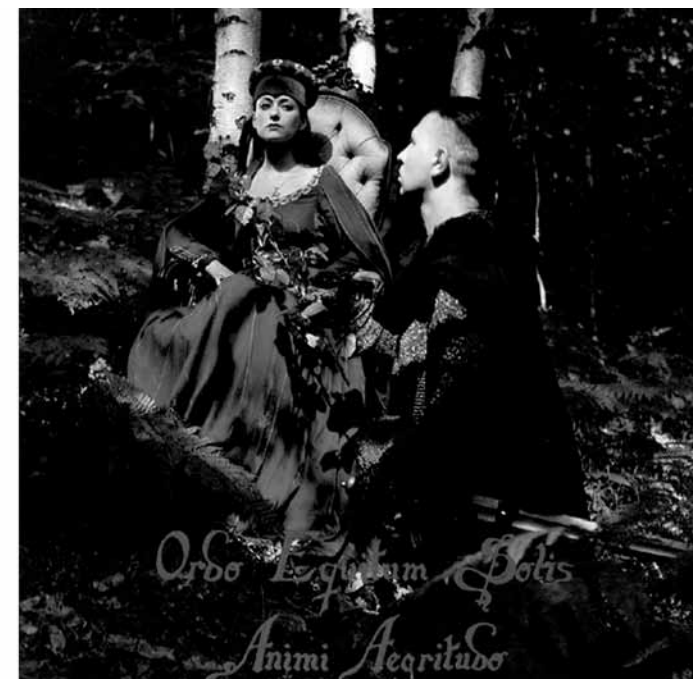
Ordo Equitum Solis Animi Aegritudo cover

in the Gothic movement during the Nineties). Firstly, one could consider that Estampie's song does not start with an instrumental preambulum: in fact it starts in medias res . However the main feature that should be noticed by the listener is the treatment of the rhythm: the track starts with a light however relentless rhythmic sequence that underlines the melody and steadily goes on for all the duration of the track. This rhythm frames the whole song, even though it forces the melodic line to be altered at some stages: it is a real effort because the melody was not born to be a rhythmic one in the way modern music is. Another relevant feature that distances the Estampie's version from the one of Ordo Equitum Solis is in the harmony: the keyboards fill up the track with a style that is clearly harmonic. This is not too invasive, however the harmony reduces a lot of the 'ancient' dimension of the listening at once. In fact it directly brings us back from the Middle Ages to an elegant and pleasant easy-listening Pop-Wave.