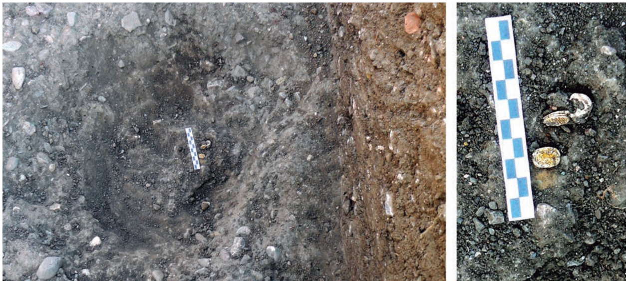
Fig. 8. View of the location of the seal-amulets deposited outside of the funerary container burial 72510 (Tomb 4).