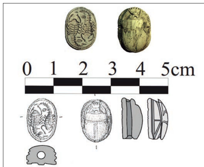
Fig. 6. Scarab 90129.

The best typological parallels are a faience (or glazed steatite ?) scarab from the oldest phase (9 th century BC) of Akhziv's family tomb T.N.1 9 , a Phoenician steatite scarab from the Beirut art market (Buchanan and Moorey, 1988: pl. IX nr. 281), and a Phoenician inscribed steatite scarab from Akko that epigraphically and iconographically dates to the 9 th /8 th century BC (Keel, 1997: 53-537 nr. 19). These are typologically identical to scarab 90129, indicating they were manufactured by the same seal cutter or at least in the same workshop. A Sidonian origin has moreover been suggested for the Akko scarab, based on the presence of a ram-headed sceptre held by one of the figures (Gubel, 2001: 41). In conclusion, the date offered by the Akhziv tomb places their production period in the 9 th century BC and the workshop is probably to be located in the Sidonian or Tyrian region.