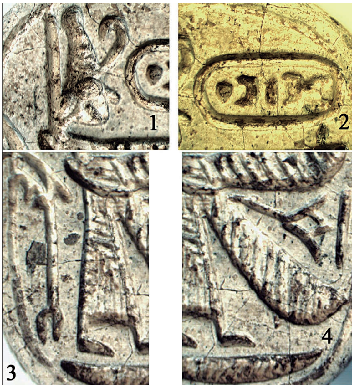
Fig. 4. Expanded view of the different elements that make up the scarab 90124.

even if it seems inspired by the throne name of the famous Thutmosis III, Mn-hpr-(k3)-r c (Jaeger, 1982: §51, 1035-1041; von Beckerath, 1999: XVIII 6.I) 3 .