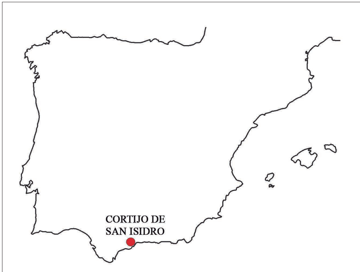
Fig. 1. Cortijo de San Isidro (Málaga) location plan.

Among the finds associated with the cremated remains of the necropolis at Cortijo de San Isidro is a small number of Egyptian(ising) seal-amulets, which will be presented here. Four stamp seals discovered until present are compared to similar finds from the Levant, Egypt and the Mediterranean. Three of them represent scarabs, the type of seal-amulet especially known from Egyptian and egyptianising glyptic traditions, while the fourth is a cowroid, an Egyptian seal shape inspired by the cowrie ( kauri ) shell. The codes referring to typological features of the scarabs' head, wings and sides refer to the types defined by Olga Tufnell, Geoffrey T. Martin and William G. Ward 1 . While acknowledging that these have been established based on scarabs of the early 2 nd millennium BC, the Tufnell-Ward typology is the basis on which additions and updates build