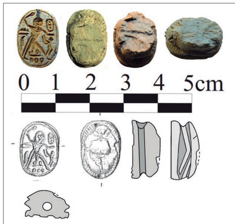
Fig. 9. Scarab 72516a.

torious ruler in full length. When several vanquished enemies are shown, the variations are more elaborate. Generally, a falcon-headed deity (probably the war god Montu) holding a ḥpš sword or scimitar aloft accompanies the sovereign, symbolising the divine approbation of pharaoh's victory over his enemies.