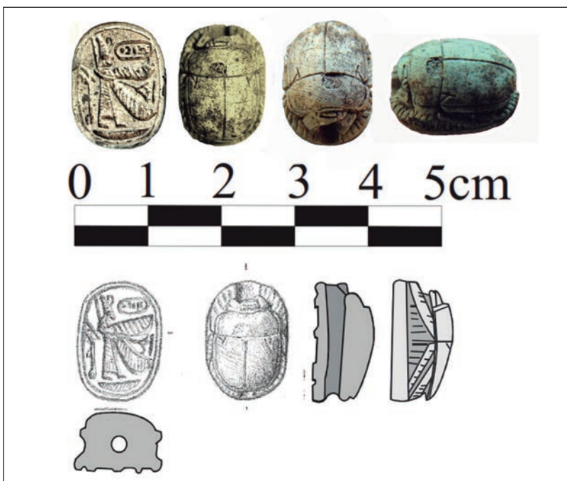
Fig. 3. Scarab 90124.