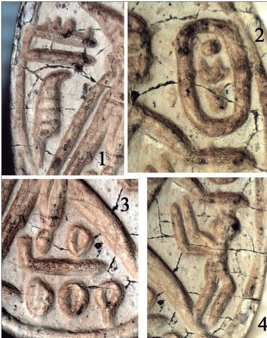
Fig. 10. Expanded view of the different elements that make up the scarab 72516a.

This cowroid can be classified in his Type III (Keel, 1995: §185), encompassing cowroids decorated with an all-round rope border ( Schnurmuster or Kerbband ) and the most common type of cowroid. The length-width proportions 14 of 1,8-2:1 are considered by Keel to be characteristic for Type III cowroids of the Late Bronze Age IIA/mid-to late 18 th dynasty (14 th century BC) and are applied to some Ramesside cowroids. In her – unfortunately barely illustrated –