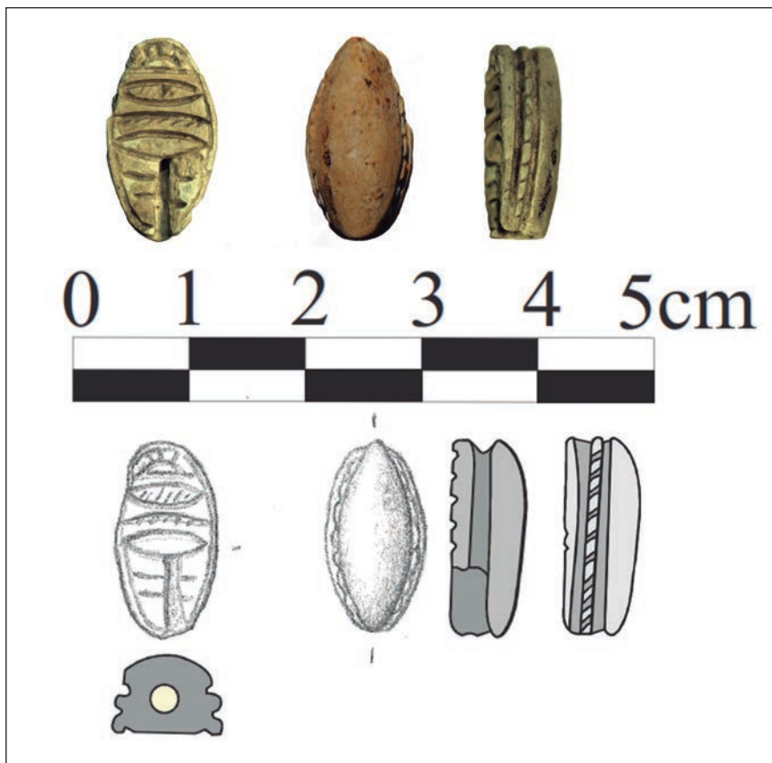
Fig. 11. Cowroid 72516b.