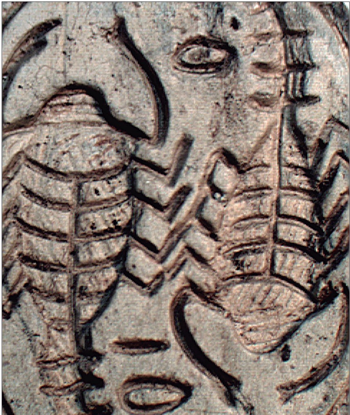
Fig. 7. Detail from scorpions of the scarab 90129.

decorate scarab bases as early as the early Middle Kingdom. The concept is, however, taken from Early Bronze Age Syro-Palestinian cylinder seals (early 3 rd millennium BC) and is therefore Levantine in origin (Collon, 2005: 24). Most common are crocodiles, lions, scorpions and caprids. Both Egyptian Middle Kingdom scarabs and the already present iconographical traditions in the Levant facilitate the transmittance of the idea to Canaanite Middle Bronze Age scarabs (Ben-Tor, 2007: 32). Compositions with animals tête-