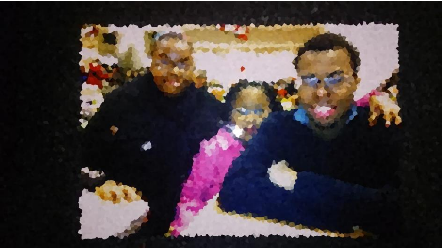
Figure 1. My brother and sister - from an adopted child's photo-album

opportunity to explore and compare divergent/convergent meanings associated to the particular images. Perhaps it would be possible to explore these aspects of family experience through other (non-visual) research techniques -such as semi-structured interviews, written diaries, etc.- but our argument is that using photographs has facilitated greatly the process or, potentially, uncovered elements that would have remained invisible through other research approaches.