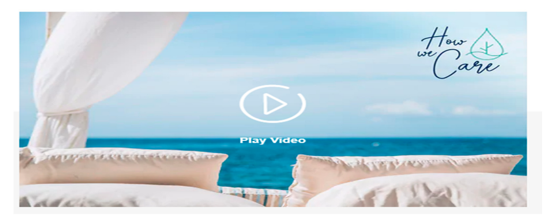
Figure 2. Iberostar.