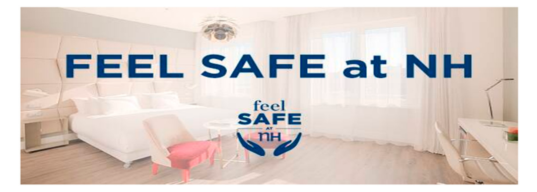
Figure 5. NH.

These campaigns are aimed at attracting and rebuilding confidence in tourists, one of today's main priorities. The hotel sector has taken sanitary measures, and these campaigns aim to create value from them by showing the creation of social distance in the jobs and leisure places, as well as changes in the accommodations. However, these measures and campaigns will only be successful if there is close collaboration between the government and the hotel sector. The government's support is needed in relation to the permitted mobility measures, opening of borders and airports, elimination of quarantine periods and other measures that pose barriers to the enjoyment of tourist activities. In addition, the hotel sector must ensure the health of tourists staying at its facilities.