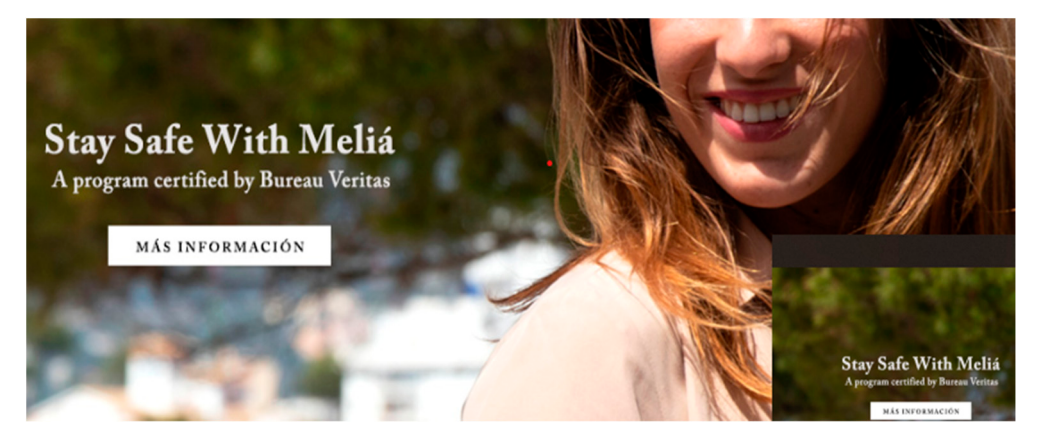
Figure 1. Meliá.

Other recovery measures that are common in all health crises have been implemented, such as the redirection of hotel marketing and sales programmes and promotional packages. As can be seen in Table 7, four of the five chains have given names to the infection prevention programmes that they are implementing. Specifically, Meliá has named it "Stay Safe with Meliá"; Iberostars, "How we care"; Barceló, "We Care about You" and NH, "Feel Safe at NH". All these programmes are available on the website of each chain. See Figures 1–5 for the websites of the channels in which these programmes are cited.