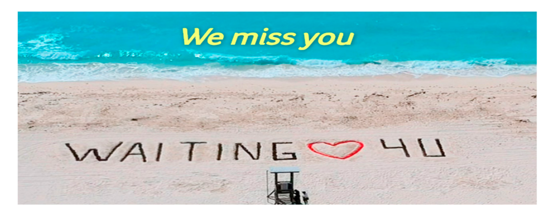
Figure 4. Riu.