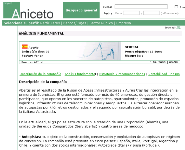
Fig. 4. Extended view of a Fundamental Analysis instance