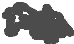
FIG. 2. Oversmoothed boundary estimation of the infarct area in Figure 1.

It is also worthwhile to observe that due to the presence of \varepsilon_n in both the numerator and denominator of (4), the variability of this estimator is not a monotone function of \varepsilon_n . This is in contrast to the usual behavior of nonparametric estimators (e.g., kernel density estimators).